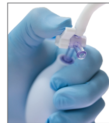
FIGURE 3 Three-way valve/stopcock ensures precise control of pressure while the large oval bulb allows for quick bladder inflation, all with ONE hand