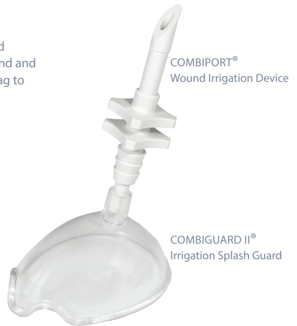
COMBIPORT® Wound Irrigation Device

Fluid flows through angled port, directed away from cleansed area and toward the outlet ports