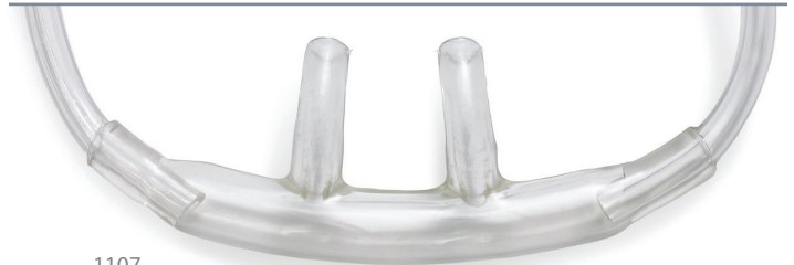
1107 Adult O 2 Cannula / FRONT DETAIL

Curved nares made of ultra-soft material