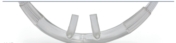
4147 High Flow O 2 Cannula / FRONT DETAIL