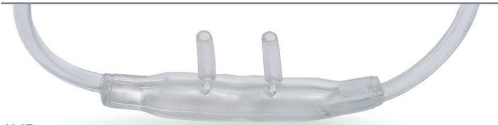
4147 Demand O 2 Cannula / FRONT DETAIL

LATEX FREE | SINGLE PATIENT USE | DISPOSABLE | CE MARK