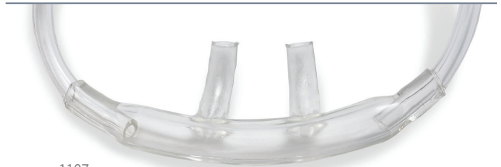
1107 Adult O 2 Cannula / BACK DETAIL