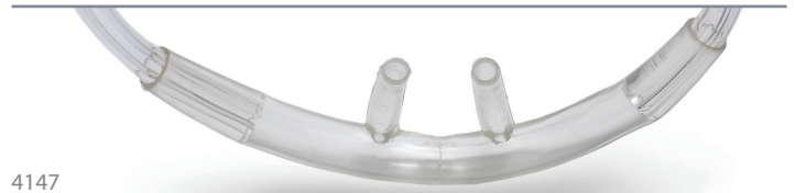
4147 High Flow O 2 Cannula / BACK DETAIL